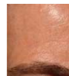
After one session 使用一次後

*Clinical test: 30 subjects after one use – anti-ageing programme.