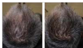
Day one 第一日使用