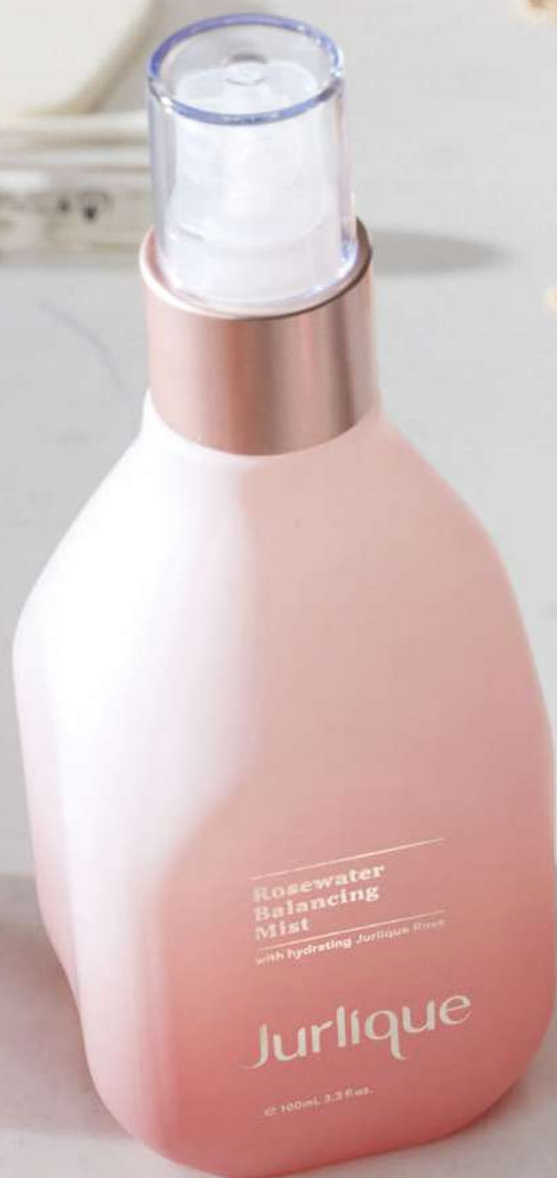
Rosewater Balancing Mist 玫瑰衡膚花卉水